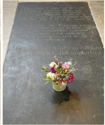
Placing a posy on the memorial stone in Romsey Abbey